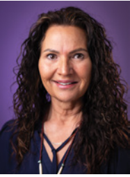
Harness Horse Technician, 1988