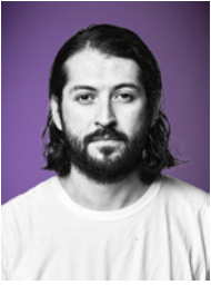
Graphic Design Production - Creative, 2010